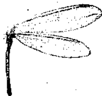
Fig. 2 Nesoleon sauteri ♀.