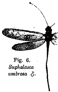
Fig. 6. Suphalasca umbrosa ♂.

Labrum pale brown. Face and vertex densely haired with long greyish white hairs on the face and long greyish brown between the antennae and on the vertex. Antennae brown, darkest towards apex and dark annulated at the joinings; the club broad, excavated on the underside, which is paler of colour than the overside. Thorax almost as broad as the head, chocolate brown with yellowish dots on the venter and with indication of a longitudinal, yellowish brown, median streak on the dorsum. The colour of the pubescens greyish brown on the dorsum, whitish on the venter. Abdomen blackish brown; the three or four basal segments dorsally with a small lunate yellowish brown marking at each side and near to the hind margin, ventrally