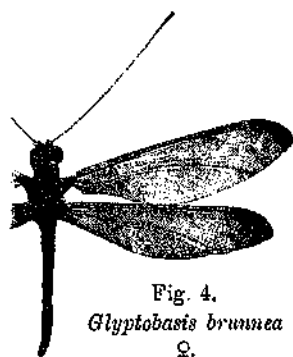
Fig. 4. Glyptobasis brunnea ♀.

Length of body 33 mm; fore wing 39 mm; hind wing 35 mm; antennae 30 mm.