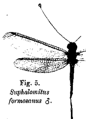
Fig. 5. Suphalomitus formosanus ♂.

The female is coloured as the male with the exception of the face, which is dark brown with paler eye-margin, but that is probably due to immaturity.